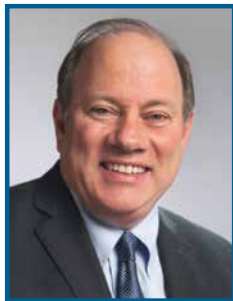
MICHAEL E. DUGGAN Mayor Detroit, Michigan