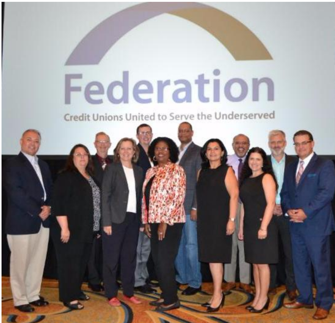
Meet the 2018 Federation Board of Directors , officially announced at the Annual Conference in St. Louis.