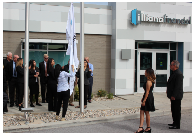
Illiana Financial FCU, Calumet City, IL