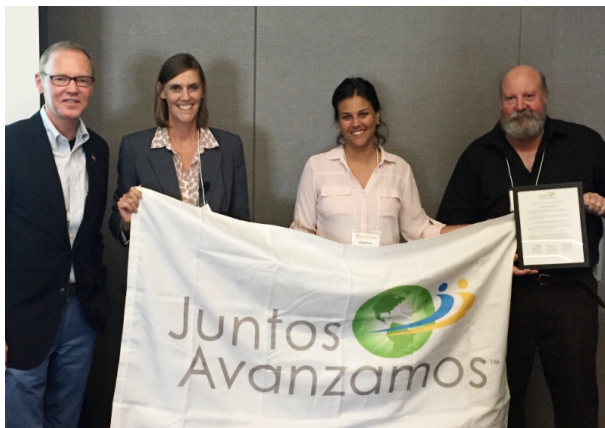
Cooperative FCU, Syracuse, NY