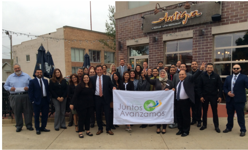
Marine CU, Milwaukee, WI