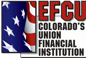
Electrical FCU Arvada, CO