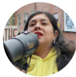
Nilbia Coyote New Immigrant Community Empowerment