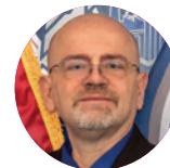
Stanley Lyzak DHS, Cybersecurity and Infrastructure Security Agency