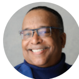
Carl Windom Windom Wisdom LLC