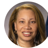
Hope Knight Empire State Development