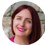
Lynne Hoey Kataly Foundation